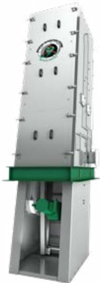
Chain & Rake Screen