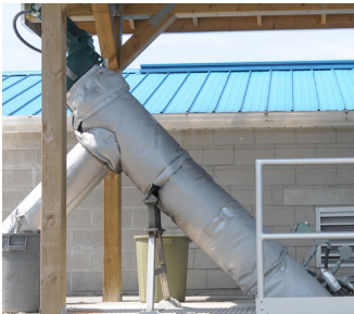
Cold Weather System Insulation Blanket