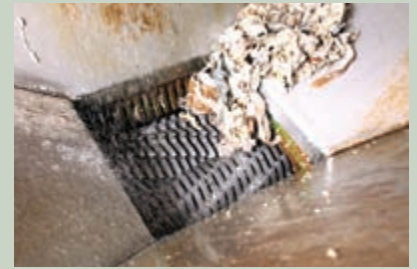
Rags and trash are flushed into the cutters, where grinding and washing dislodge fecal matter.