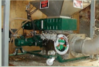
Optional roller base makes moving the system quick and easy