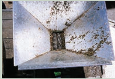
Custom hopper variation