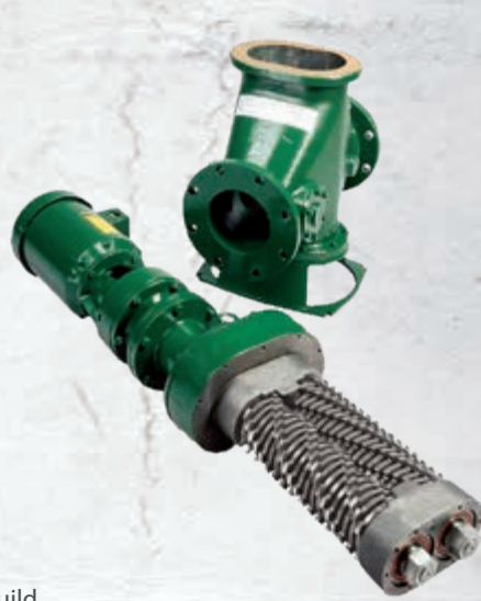
Grinder Cartridge with all housing assembled and ready for installation