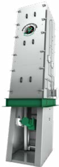
Chain & Rake Screen