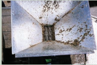
Custom hopper variations