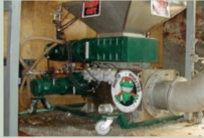
Optional roller base makes moving the system quick and easy