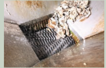
Rags and trash are flushed into the cutters, where grinding and washing dislodge fecal matter