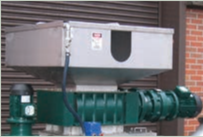
Custom hopper sizes and hopper covers