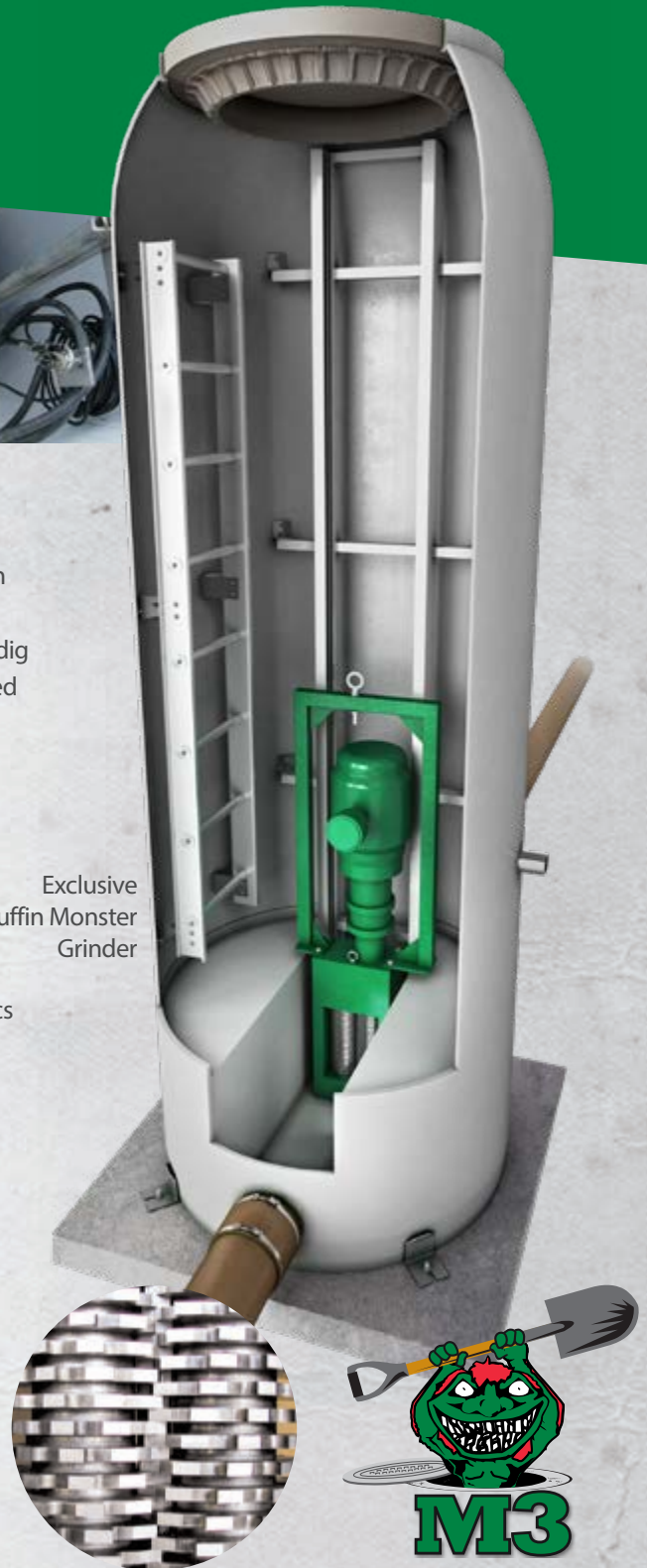
Exclusive Muffin Monster Grinder