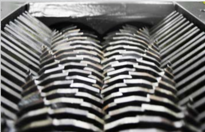
A close-up view of the cutters