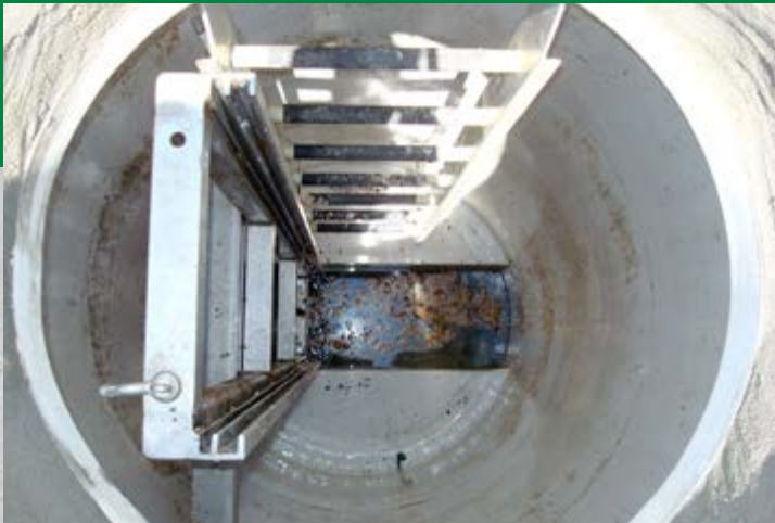
Guide frame and access ladder Inside the M3 (the grinder has been removed)