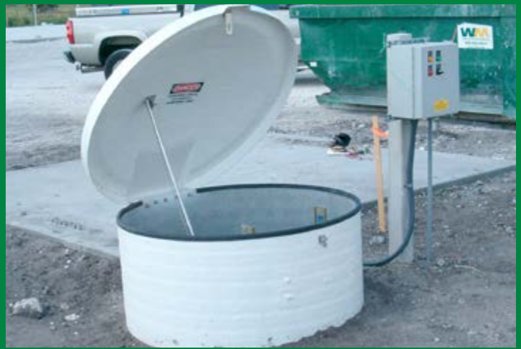
Hatch access door to M3 (street manhole option also available)