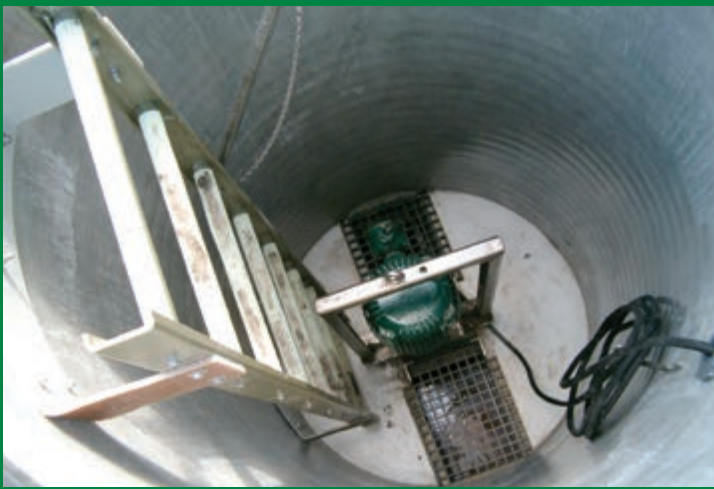
Top view of Muffin Monster Manhole