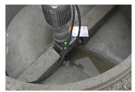
A 3-HYDRO-C sewage shredder with immersible motor at a veterinary clinic