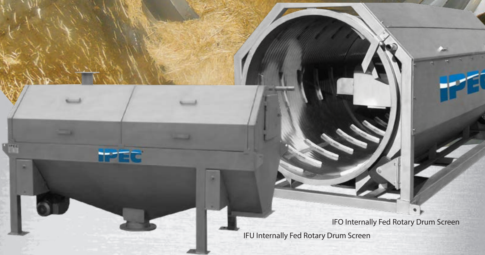
IFO Internally Fed Rotary Drum Screen