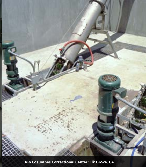
Rio Cosumnes Correctional Center: Elk Grove, CA