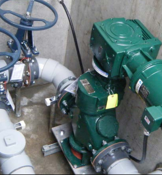
Vancouver Detox Center: Vancouver, BC, Canada