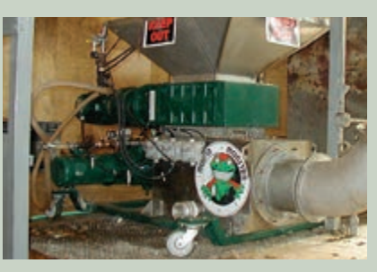
Optional roller base makes moving the system quick and easy