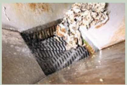
Rags and trash are flushed into the cutters, where grinding and washing dislodge fecal matter