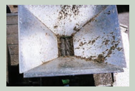
Custom hopper variations