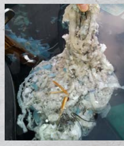
Figure 1. The tendency of long, stringy fibers and hair to weave themselves into long ropes or mats that clog pumps underscores the importance of sewer grinders and cutters that can chop debris into small pieces without letting long strands slip through.

Dimensional Tolerances. Anyone who has ever tried to cut resilient material with a loose pair of scissors knows how easy it is for flexible materials to wedge in between the blades instead of shearing cleanly. Likewise, cutters with larger gaps across their shearing surfaces compromise the ability to shred those resilient materials, creating the potential for long strands to escape through the gaps and reweave themselves into ropes that can clog pumps, screens, and other downstream structures.