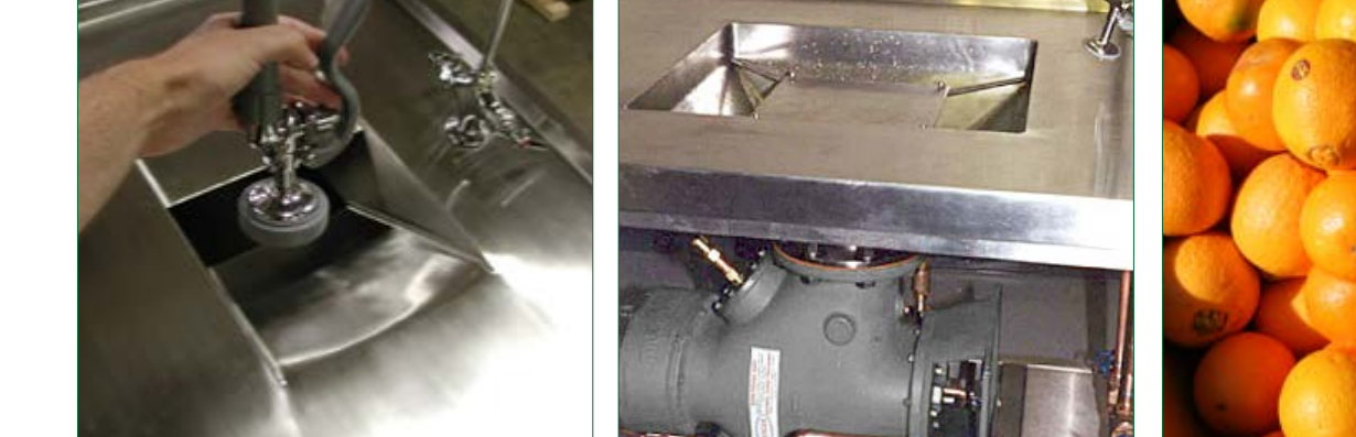
Compact and Efficent Design

Grinder Cutters: Heat treated alloy steel, surface ground for uniformity and through-hardened. Seal Faces: Tungsten carbide / tungsten carbide. Plumbing Includes: Wash wand, water valve and shut-off valve.