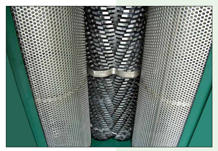
High-flow screening drums capture solids and directs them into the grinder

For further information contact JWC Environmental, 290 Paularino Ave., Costa Mesa, CA 92626, USA, Tel: 949-833-3888, Toll-free 800-331-2277, Fax: 949-833-8858, Web: www.jwce.com, E-mail: jwce@jwce.com.