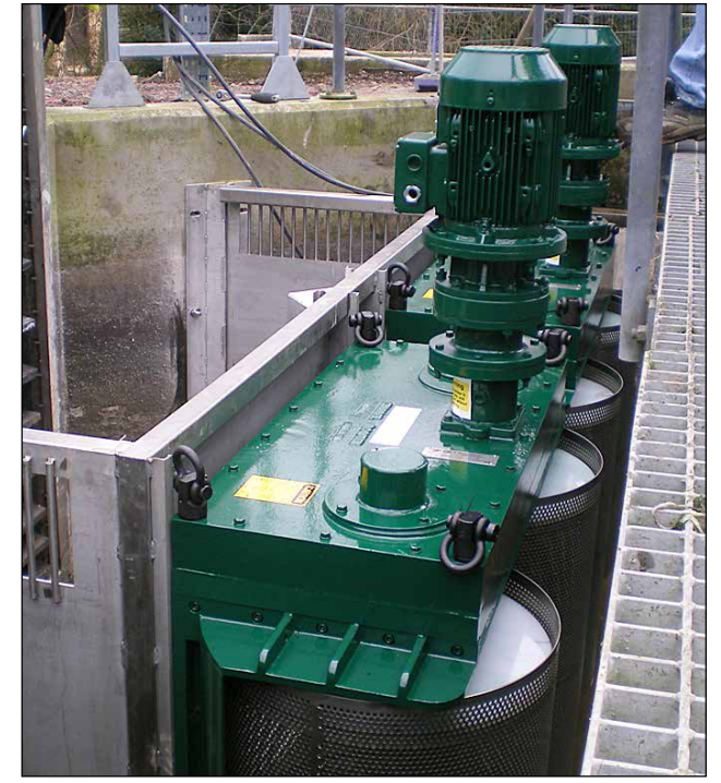
The Channel Monster combines rotating screening drums with proven Muffin Monster grinding technology.

PROBLEM: Debris rendered headworks screens ineffective