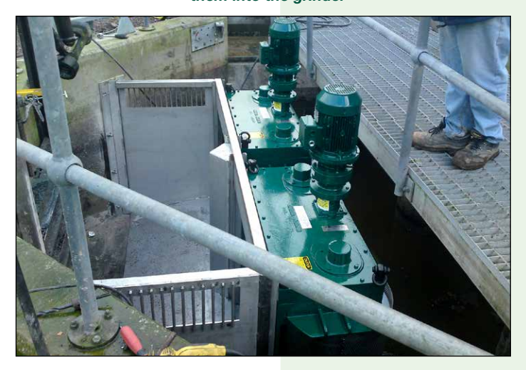
Shown here are JWCE's custom made stainless steel inlet channel, overflow outlets with two Channel Monster grinders

"I needed a simple, easy to install and maintain solution... JWCE more than met my expectations and provided my team with a simple solution in the form of their Channel Monster Grinders"