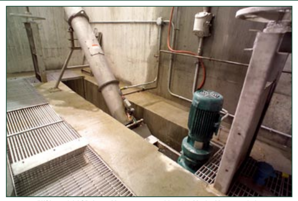
JWC's model AGD Auger Monster screen with 40002 Macho Monster grinder.

New England Environmental Equipment, Inc is a Bedford, Massachusetts based representative for many of the leading names in wastewater, including the Muffin Monster family of products. The dedicated staff provides on site sales visits as well as offering training and support for wastewater equipment. On the web at <u>www.ne3inc.com</u>.